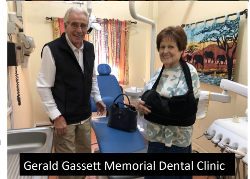
Gerald Gasset Memorial Dental Clinic

· July - GO Team from BFC dedicates the Gerald Gasset Memorial Dental Clinic at Raleigh Fitkin Memorial Hospital as the first public dental clinic in Swaziland.