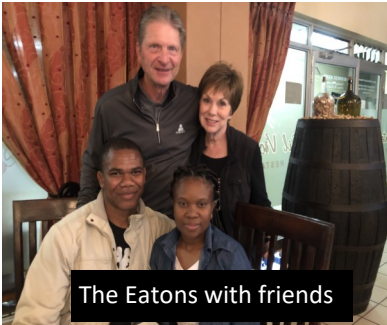
The Eatons with friends