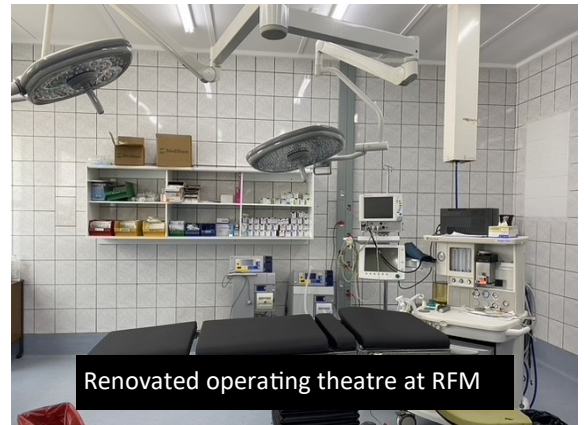
Renovated operating theatre at RFM

· The operating theatre at Raleigh Fitkin Memorial Hospital (RFM) was completely renovated due to the generosity of the